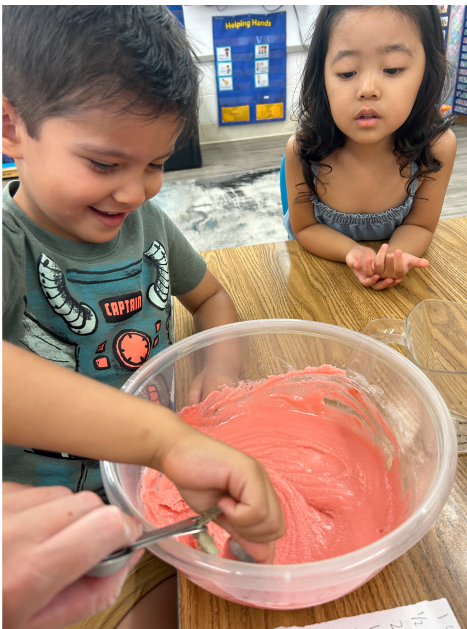
Mixing up the Playdoh - Students in B3 enjoy mixing playdoh on their first day of school.