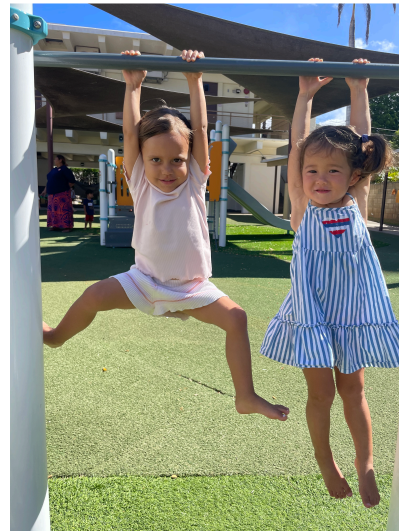
Just Hangng Around - Two students of C1 are "monkeying" around on the monkey bars.