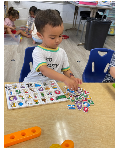
Puzzle Solving - A student in C2 starts an alphabet puzzle.