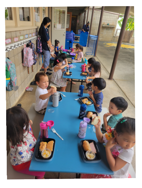
Dining Alfresco - Students of C1 enjoy eating their lunch outside their classroom, on a beautiful sunny day.