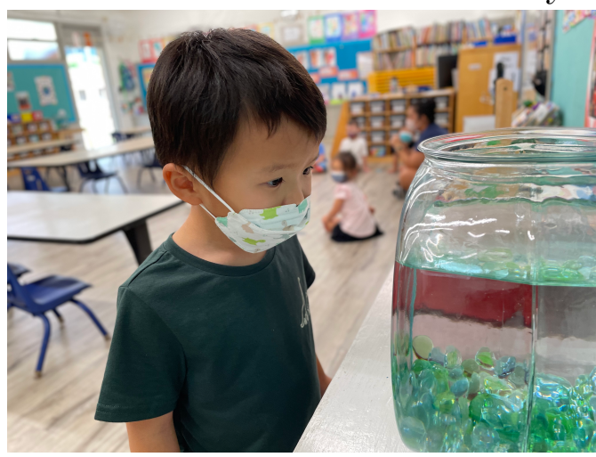
Friendly with the fish - A student in B1 observes the class fish, Bella, to make sure she is healthy and fed.