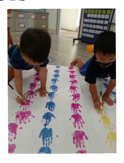
Making the count - Students in B2 get hands on with the numbers to show "How Many Handprints Tall, Am I?"