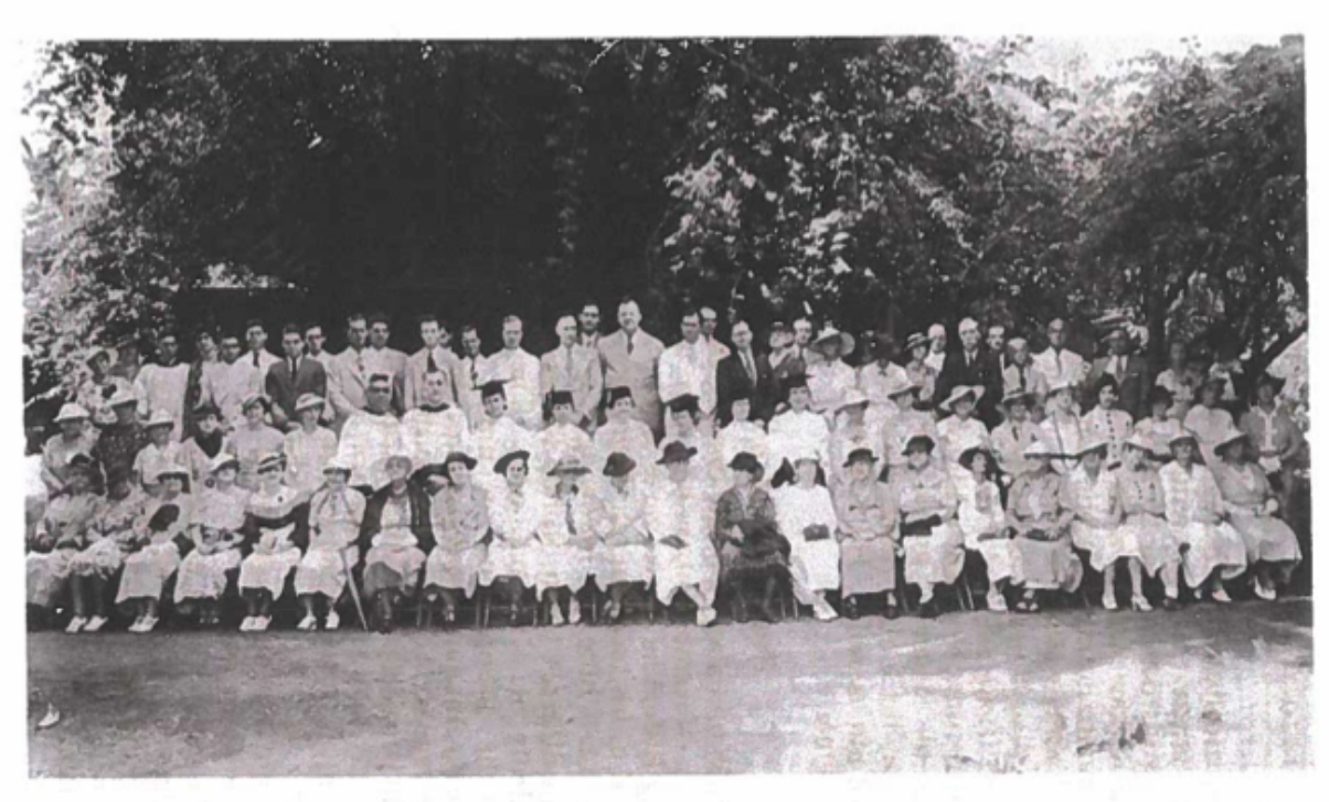
A TYPICAL SUNDAY CONGREGATION OF ST. CLEMENT'S Including Rector, Choir, and many old and new parishioners, as they gathered before the Eleven o'Clock Service on All Saints' Day, 1936