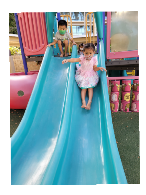
Fun in the Sun - Students in B3 enjoy sliding down the slide on a nice September morning.