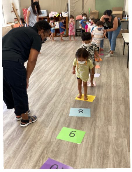
The M&M's, Math and Musical Fun - The students of C2 learn math with the fun addition of music for a great activity with their teachers in Math Music Motion.