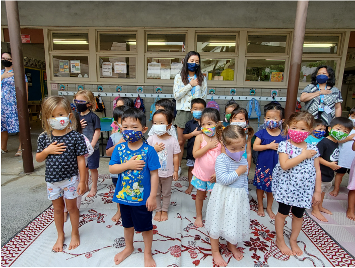
Students of B1 during Friday Assembly saying the Pledge of Allegiance.

A sneak peek into a school day at St. Clement's