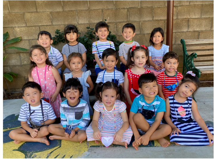
B2 started off the Preschool 4 Spirit Week by wearing polka dots and/or stripes.