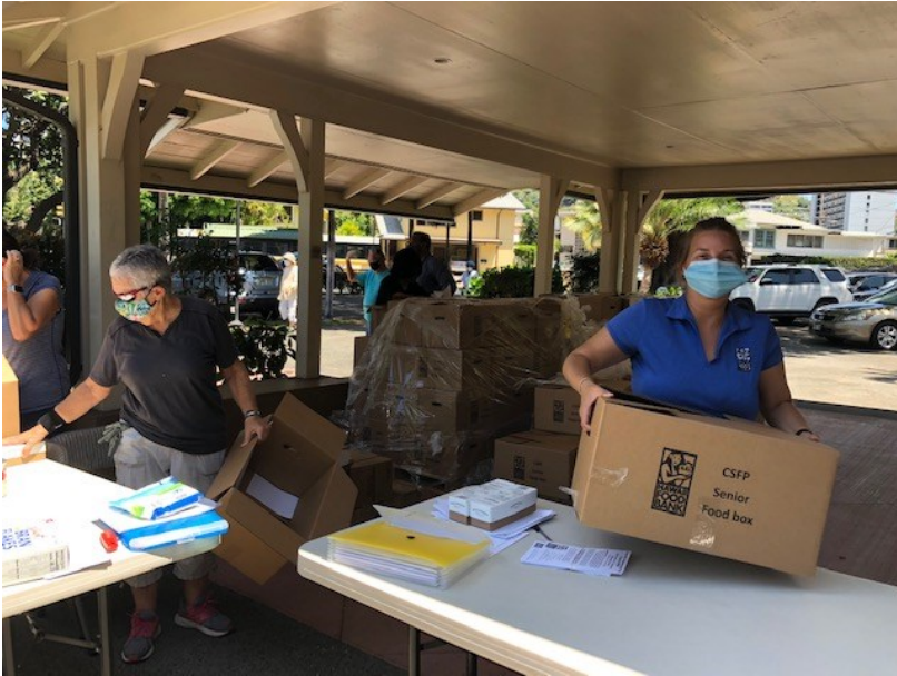
Volunteers from the Hawaii Foodbank distributing Kupuna Boxes

The Parish of St. Clement is now a pick-up location for the Hawaii Foodbank's Kupuna Box program. People over the age of 60 with low income are eligible to sign up for this program through the Foodbank. On the Third Friday of every month, the Foodbank sends its volunteers to St. Clement's along with multiple 30-pound boxes of food to give out to those in need!