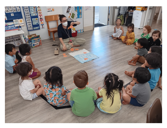
Sink or Float? - Students in C3 were challenged with hypothesizing if a pumpkin will sink or float when placed in water.