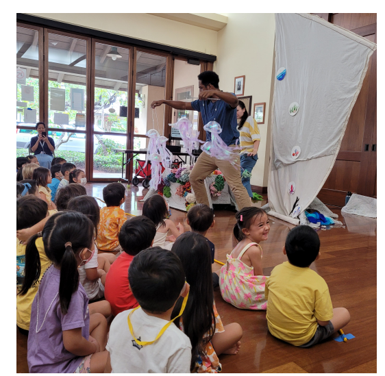
Theater Fun - On Monday, October 23, the Honolulu Theatre for Youth visited campus and performed "Under the Blue."

Parents Reading - With COVID restrictions easing up, the School is welcoming parent volunteers back on campus.