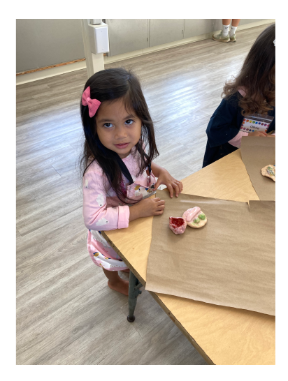
Fun with Claytime -A student in C2 shows off her ceramic pieces she made during their weekly ceramics class with Claytime Hawaii.

Through the Woods ... - On Saturday, October 21, the School hosted a "Enchanted Forest - Halloween Walk" for all students and their families.