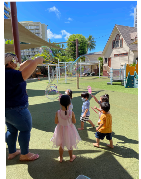
Playing with Bubbles! - Students in C1 have fun in the sun with bubbles during Playground time.