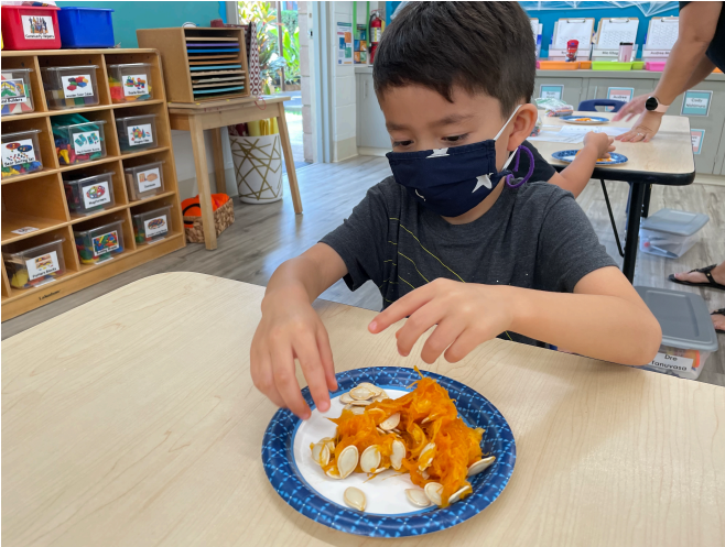
For Science! - A student in B1 studies a pumpkin for science.