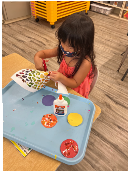
Somewhere over The Rainbow with Food! - A student in B2 cuts different colored foods to match the beautiful spectrum of the rainbow.