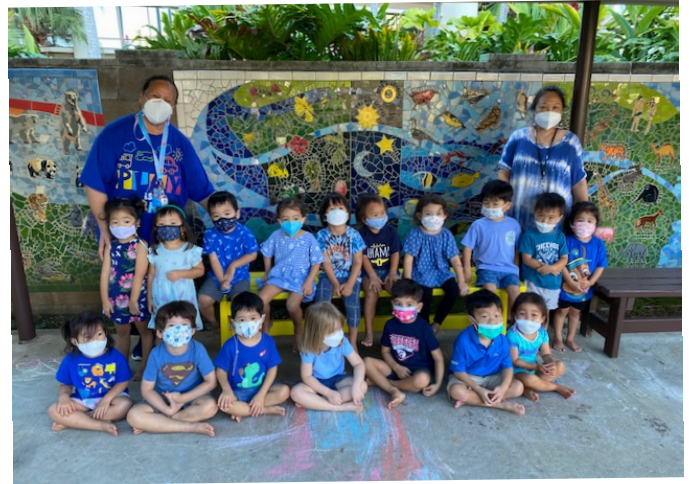
Beautiful in Blue! - The students and teachers in C2 celebrate the color blue by wearing all things in blue!