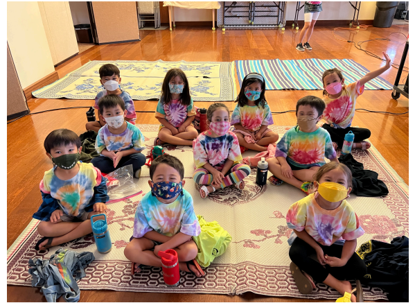
On Saturday, May 15 we hosted Movie Night for our students. A night filled with song, dance, activities and more!