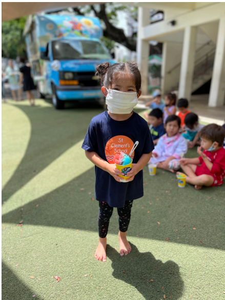
Our Na 'Ohana treated us all to a shave ice truck to cool us off on a hot afternoon.