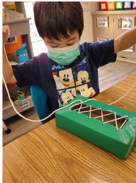
The students of B3 learned how to tie their shoes.