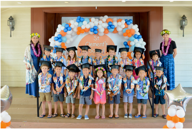
On Wednesday, May 25 we held our Graduation Ceremony for B4 (Kindergarten - pictured), B3 and B2 classrooms.

End of School Year Celebrations at St. Clement's