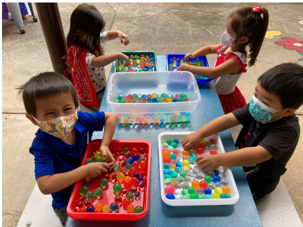
Our C2 class celebrated the end of the school year with a day of fun with water.