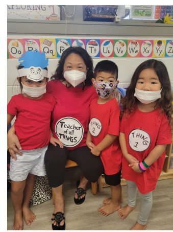
The whole school participated in Spirit Week and one day the theme was to dress as Dr. Seuss characters.