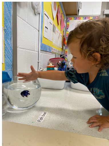
Fish Feed - A student from C1 feeds the class pet fish.