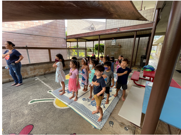
Assembly - The class of B4 stood for the Pledge of Allegiance during a Thursday morning assembly.