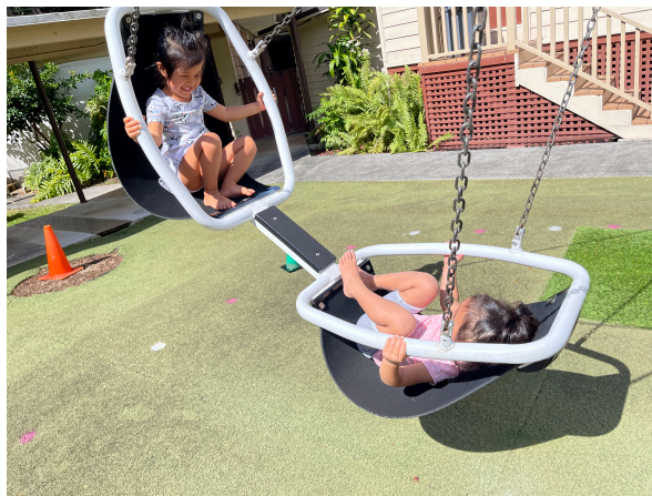
Swings - Students from C2 enjoy playing on the swings during playground time.