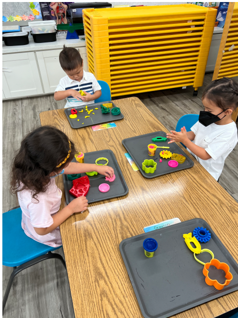
Playdoh - Some students in B3 worked on strengthening their fine motor skills by working with Playdoh.