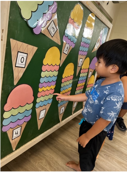
Ice Cream - A student in B1 participates in an ice cream math activity during Math Music Motion.