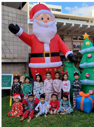
The Preschool's 4 grade level all dressed in their pajamas for Pajama Day.