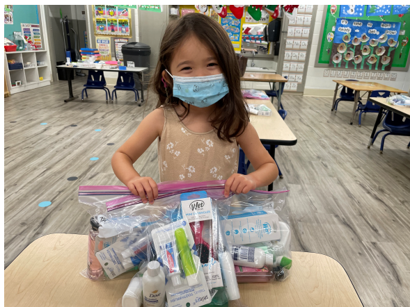
Students of St. Clement's School donated bags of toiletries for those in need for their annual Joy of Giving Drive.

A view into the school days at St. Clement's