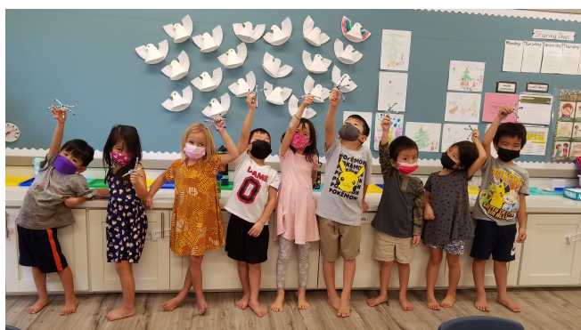
Students in our After School Program enjoyed showing off the snowflakes they created with pipe cleaners and beads.