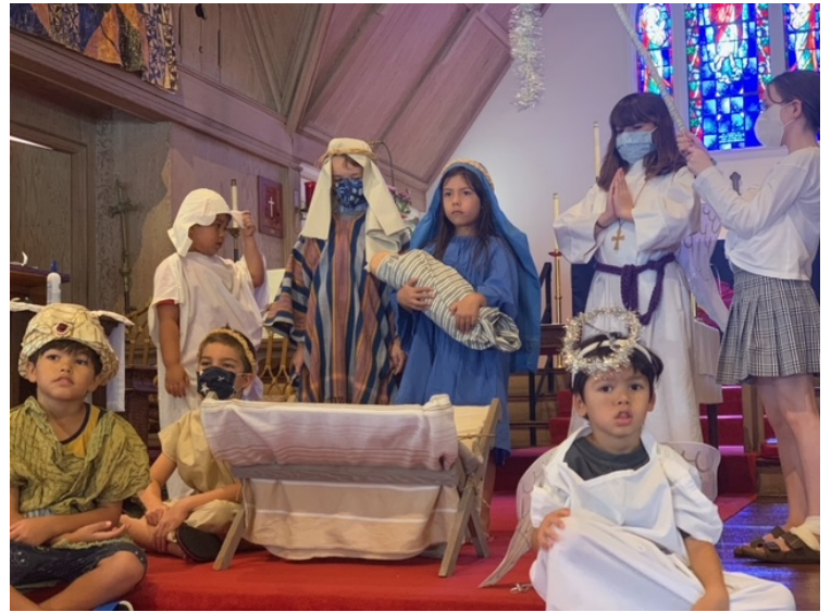
Sunday School's students in tableau during the Ceremony of Lessons and Carols.