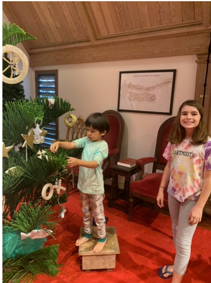
Sunday School students putting ornaments on the tree.