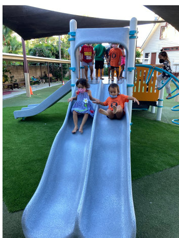
Students in C2 enjoyed playing on the newest playground equipment that was installed over the Thanksgiving holiday.