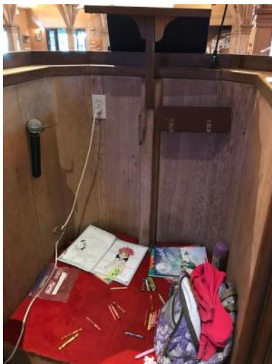
Behind the Pulpit...