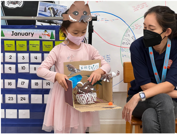
A student in B2 shares her project on the elepaio. Each student was responsible for researching and creating a visual on a bird of their choosing.

A view into the school days at St. Clement's