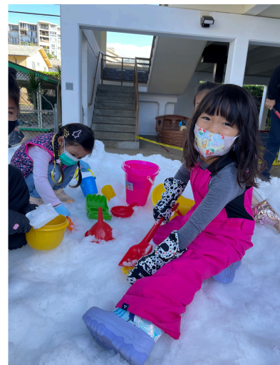
A student in B3 enjoys playing in "snow" at St. Clement's School's first Snow Play Day since 2020.