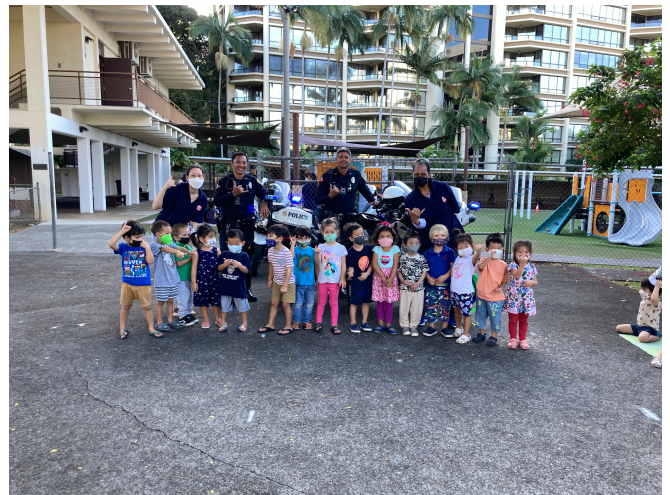
Our C3 class takes a picture with Honolulu Police Officers and their motorcycles.