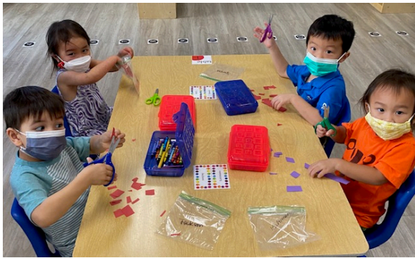
Students in C2 practice their cutting skills by using scissors to cut paper.