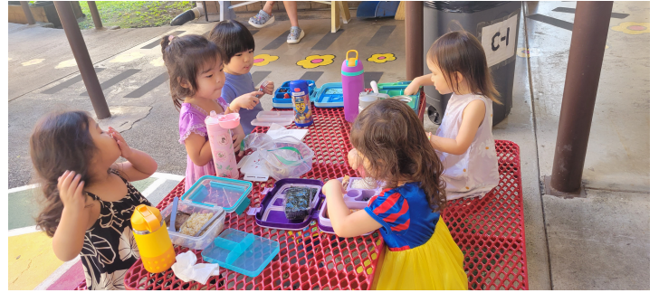
Students of C1 enjoy eating their lunch outside their classroom on a lovely January day.