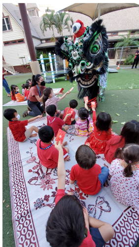
Students in B1 feed the Chinese lions lai see during their annual performance at St. Clement's School.