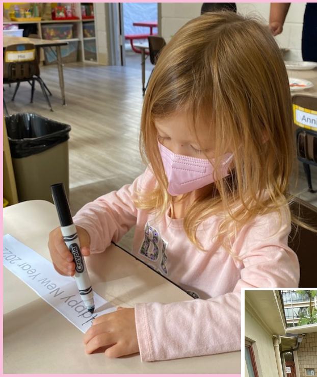
A student in C1 practicing their fine motor skills by writing out "Happy New Year!"

A sneak peek into a school day at St. Clement's