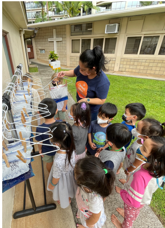
The students in C3 created a tiger mask to celebrate the upcoming Year of the Tiger.