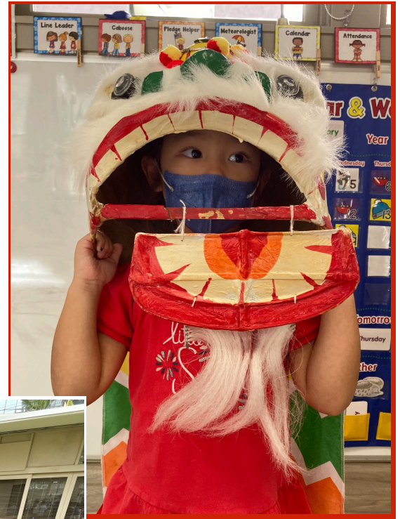
Students in C2 got to put on their own Chinese Lion dance in preparation for Chinese New Year.