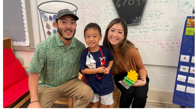
Parents Pairing for Crafts - A parent team of B2 came to lead the class in crafting a turkey.