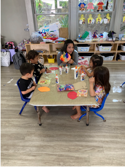
Parents Crafting - Some moms of C2 came to visit the class for a Thanksgiving craft.

A view into the school days at St. Clement's