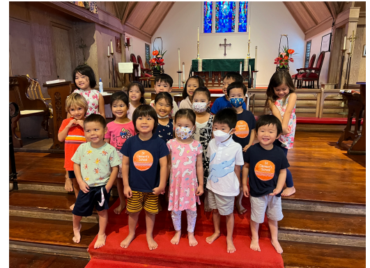
Leading in Chapel - The class of B1 stood at the front of Chapel to lead in song and prayer. Families got to enjoy games, crafts and entertainment.