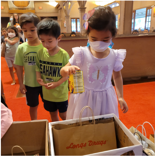
Canned Food Drive - Students in B3 donate their canned goods to the School's annual Thanksgiving Canned Food Drive.