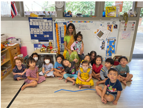
Sharing Diwali's Culture- A parent of C3 came to share her culture and teach the C3 students about Diwali.