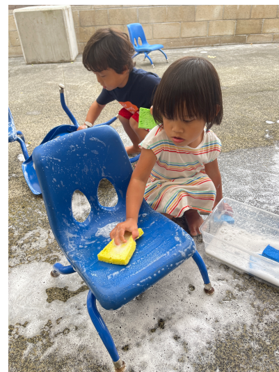
Students in C2 close out Summer School by washing down chairs they have used while learning about respecting school property and taking care of one's belongings.