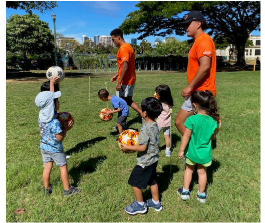
Students in B1 enjoy learning soccer skills from the staff of Ohana Kids.