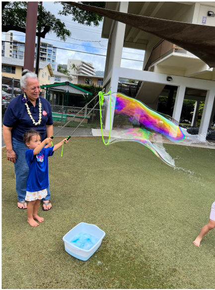
A student and teacher of B3 enjoy creating big bubbles on the playground.