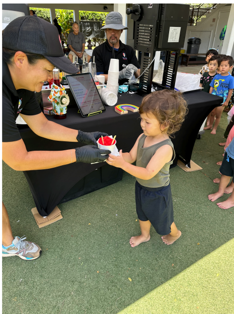
A few families donated a yummy, cool treat to enjoy on a hot day: shave ice!