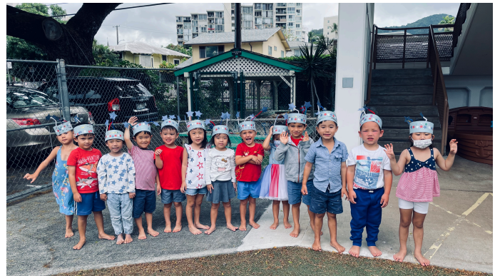
The class of B2 dressed in red, white and blue to celebrate the 4th of July with a colorful parade.