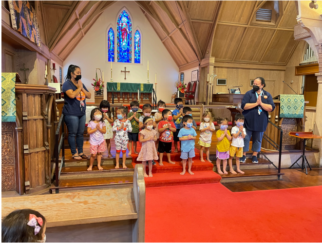
The class of B1 helped lead prayer during Chapel.