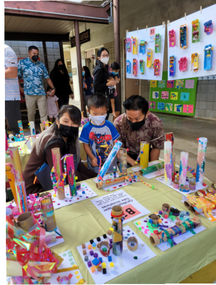
Our school hosted an Art Show for our families to attend. It featured artwork from all our classes. Here a student from B3. shows his parents his 3D sculpture art.