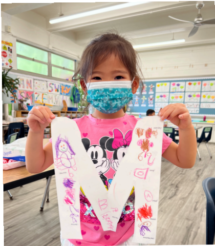
A student from B4 shows her symmetrical letter "M" with things that start with "M".