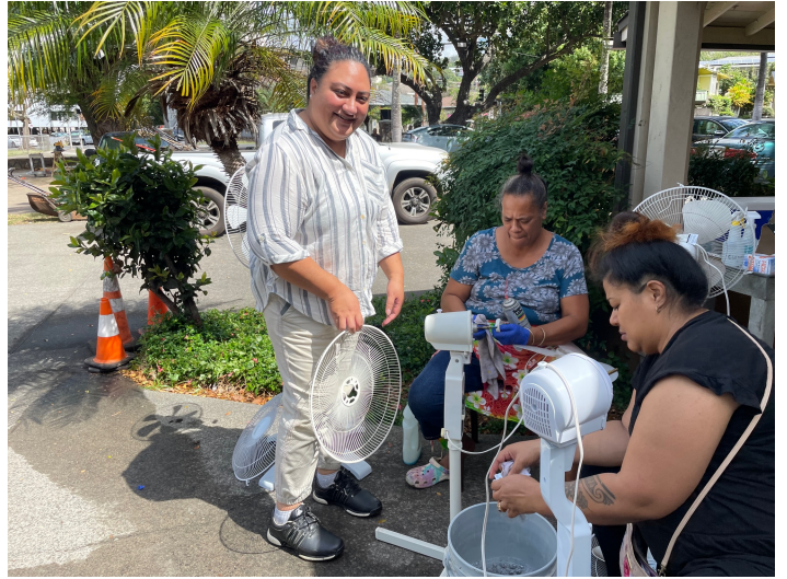
Members of the Tongan Congregation